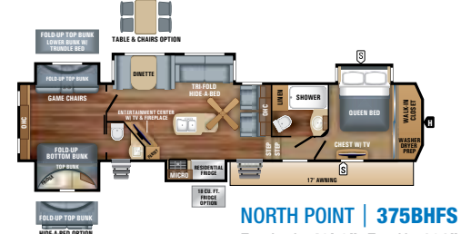
Ext. Lgth: 43' 3" Ext. Ht: 161" Unloaded Wt. (lbs): 14,125 Sleeps: 9-11